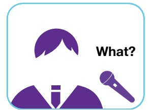
3. (MCU) Shot of the interviewer asking the questions.