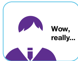
5. (Noddy) Shot of the interviewer reacting to his guest's answers. Can also be used as a cut-away shot at the end of the interview.